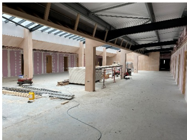
As at March 2021

The site will have 2 multi – unit buildings. The First building is nearing completion and will be available for occupation within the next 2/3 months. The Second building is expected to come on stream mid 2022.