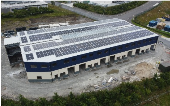
As at March 2021