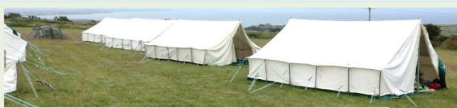
When I fell off my surfboard, I was going under the water but before I went under, I could see the surfboard spring up! - Alfie