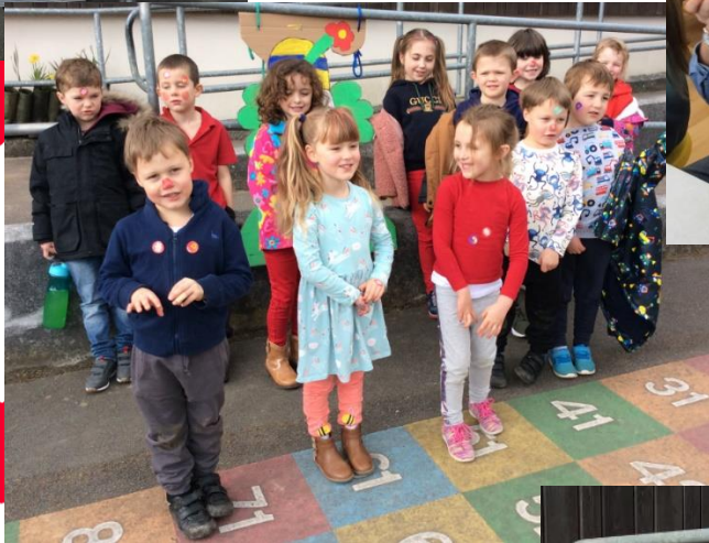
Stick the red nose on the clown game