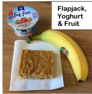
Flapjack, Yoghurt & Fruit

Following feedback from parents, the meal options have increased slightly, and children can now choose from 3 sandwich options daily, aside from the usual main meal and veggie option. You will have noticed that the dessert no longer appears on the choices within School Gateway. Instead, the children can choose at lunchtime to have that day's main dessert, a yoghurt or a piece of fruit. All the images on the right have been taken during lunch service to give an idea of some of the delicious meals on offer to the children.