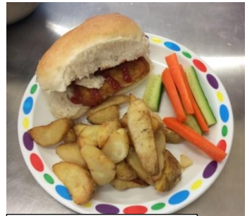
Fish Finger Butty, Wedges & Veg Sticks