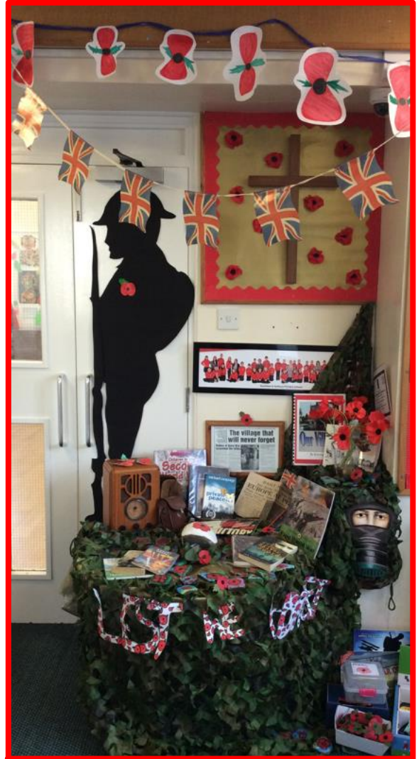
Our Remembrance display in the school reception

The British Legion, who led our worship on Wednesday and spoke to us about how the money that is donated to the British Legion through the Poppy appeal is spent.