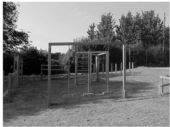
The play-equipment in the school grounds

Each new parent is encouraged to become a member of the PTFA and is invited to attend meetings and support our fund raising activities. Annual events include a Duck Race in the summer and a Christmas Fayre.