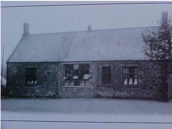
Northlew Primary School in 1866

Northlew & Ashbury Parochial Primary School is a Church of England school that was established in 1866. Its doors first opened in January 1867 and it provided a varied education for the all the children of Northlew and Ashbury. It was not until 1945 that the junior children were transported into nearby Okehampton to receive further education and the school became a primary school, serving 4 - 11 year olds. In 1984 the school was declared a voluntary controlled school although it still maintains close links with the church.