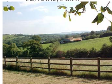
Views of Dartmoor from our playground