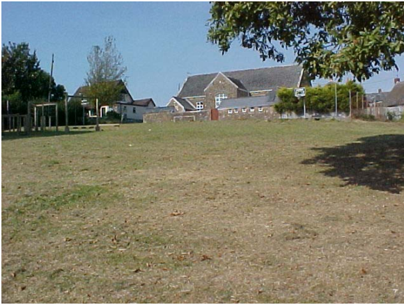
The school viewed from the edge of the grounds

the school and is very affordable. Alternatives can be obtained outside of school as long as they follow school colours and style.