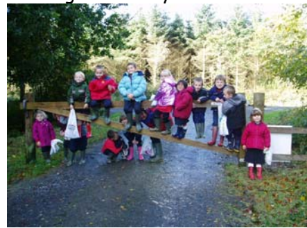
Reception and Keystage 1 enjoying a trip to the forest to study the colours of autumn