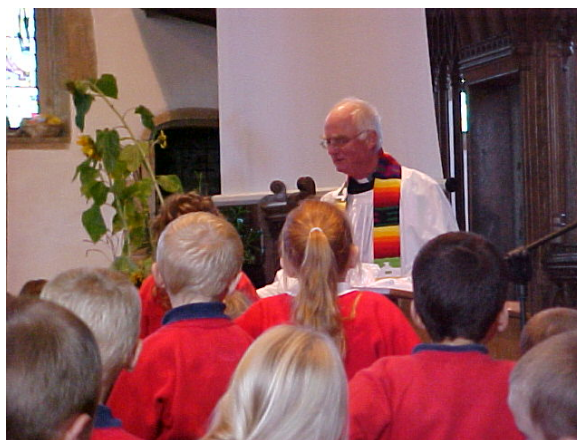
Taking part in a church service.

the prospectus. Admissions will become central through the Devon County Council Admissions Team from Autumn 2006.