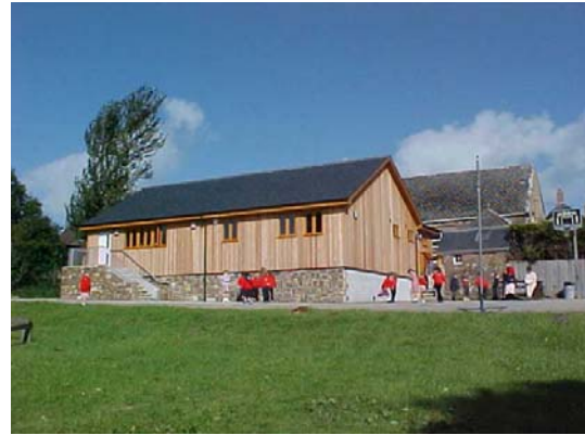
Northlew and Ashbury Primary School 2004

I welcome you and your child to Northlew Primary School and hope that this prospectus will provide a useful source of information about the school. Please visit us whenever you wish, we encourage parents to help in school and be actively involved in the education of their children.