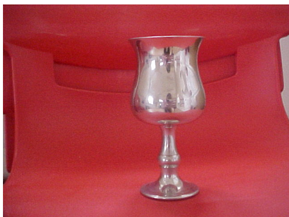
Winners of the Small Schools Athletics Sports Cup

We have forged links with other local schools to arrange netball and football matches, this also provides valuable social interaction between ourselves and other small schools. Despite being a small school we have had many successes in our sporting endeavours.