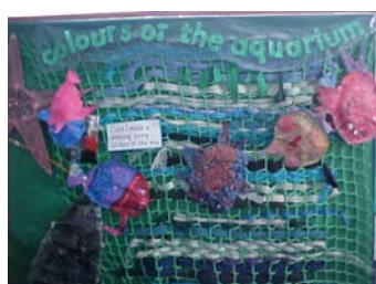
Colours of the Aquarium - a school display

Our aim is to provide the best possible learning environment for all the children in a caring supportive atmosphere.