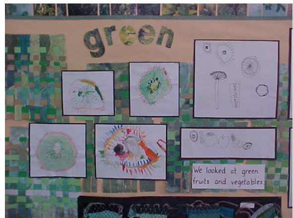
Keystage 1's project work on the colour 'green'

With regard to short-term illnesses we do prefer not to have medicines in school. However, we realise there are exceptional circumstances and would therefore ask that you discuss any particular difficulties with the headteacher.